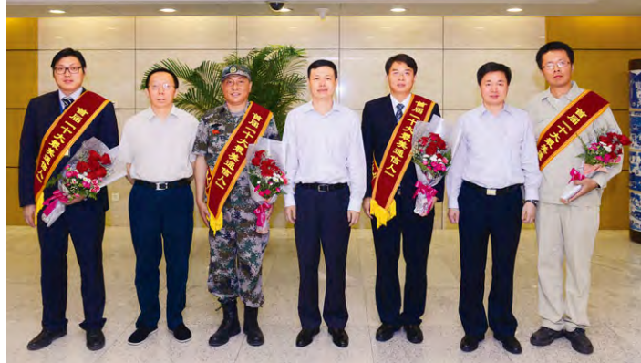
The inaugural “Ten Best Talents in Telecommunications”

Reflect and address the needs of employees at the policy level, safeguard the interests of employees. The Company strove to understand the work life of frontline employees and their difficulties and problems, and to resolve the root causes of the problems through the democratic management platform and policy formulation. In 2015, after thorough investigation, analysis and reflection, specific difficulties were resolved, such as heating problems during winter, labour protection from both low and high temperatures at labour sites, protection of construction and maintenance labour, and protection for the frontline female employees. At the same time, through the strengthening of the institutional construction, we promoted frontline corporations to formulate policies protecting vital interests of employees to safeguard their legitimate rights and interests.