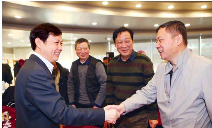
Meeting with retired employees in Chinese New Year