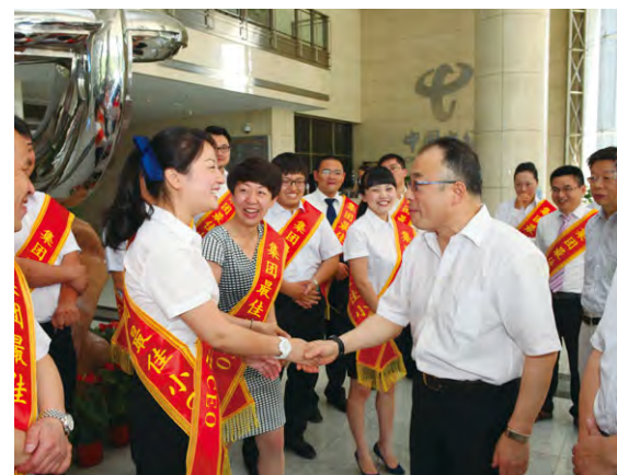
Award ceremony for the national best "unit CEOs"